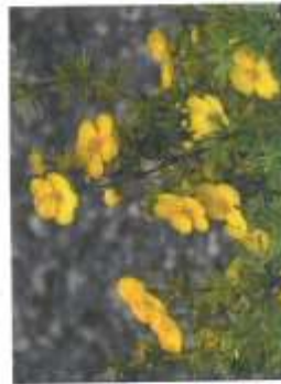
Sutter's Gold Potentilla