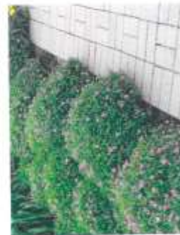
Max Frei Geranium